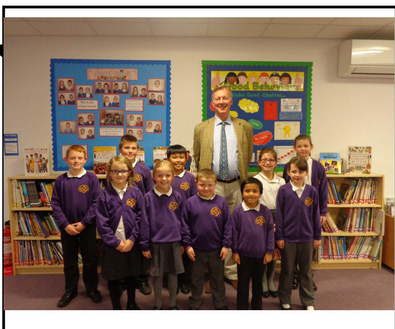
Visit by Bill Wiggin MP

It was a pleasure to welcome our local MP, Mr Bill Wiggin to the school on Friday 17th March. Mr Wiggin played a key part in the planning and building of Leominster Primary School and he was very impressed by the children, the building and all the activities he saw as he walked around.